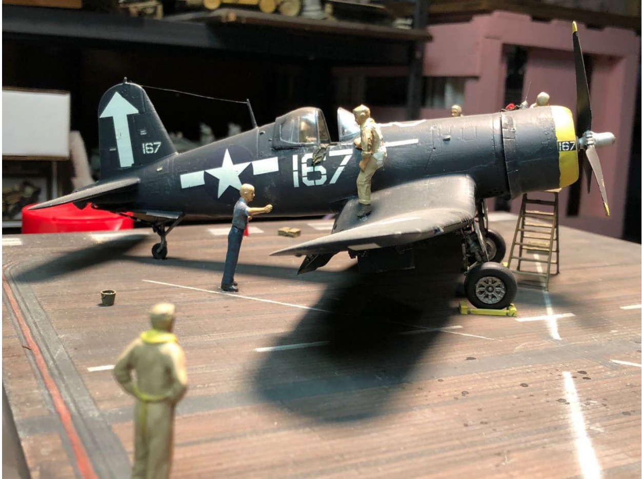
Mechanics prep a Navy Corsair for takeoff from an aircraft carrier deck.