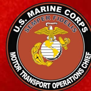
Motor Transport Unit