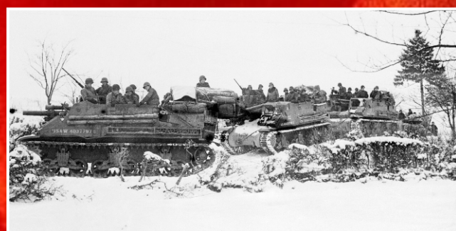
Battle of the Bulge